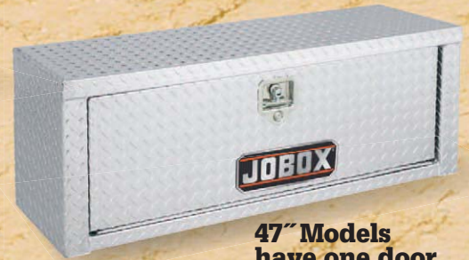
47" Models have one door