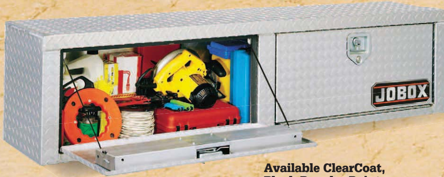
Available ClearCoat, Black Powder Paint or Unpainted Finishes