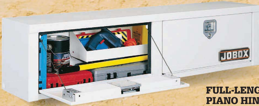
Available in Armor-Brite® White or Black Powder Paint

Mounting Kit Includes support legs and hardware