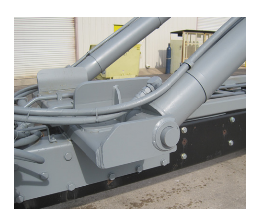
Reinforced Lower Lift Bracket