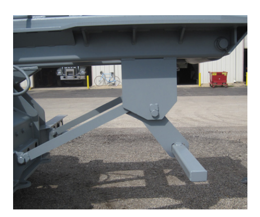
Auto Fold Forward Bumper