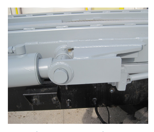
Reinforced Upper Lift Bracket