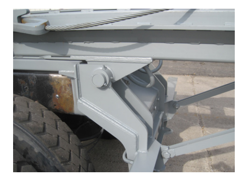
Hinge Positioned in Standard Location

Patent pending. Gives the hoist a smoother operation and lowers operating stress reducing overall wear and tear on the hoist, frame, and cylinders.