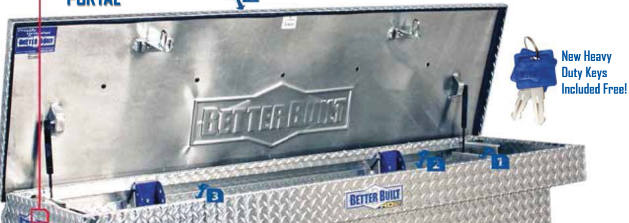
Inc the intr

4-Stage Automotive Grade Rotary Latches With Billet Push Button Locks