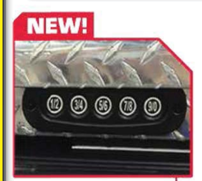
KEYLESS ENTRY FOR CROSSOVERS