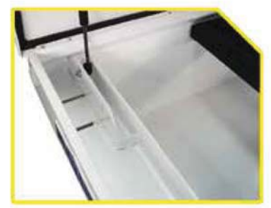
SMALL PARTS PARTITION WITH SHOCK GUARD