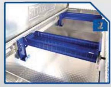
REMOVABLE STEEL LEVEL HOLDERS