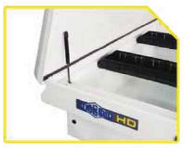
NEARLY 90° AUTO LIFT HD SHOCKS AND NEW POWER PORTAL