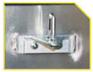
PATENTED SELF-Adjusting Striker