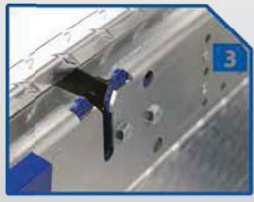
4 STAGE AUTOMOTIVE GRADE ROTARY LATCH