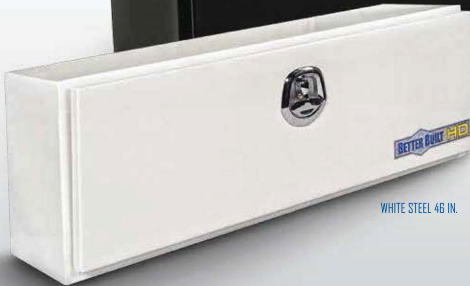
WHITE STEEL 46 IN.