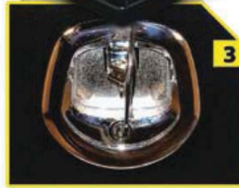
DUAL LOCKING CAM ACTION LATCHES