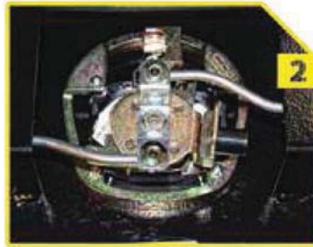
HEAVY DUTY 3-POINT LOCKS