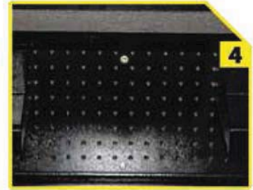
INTERIOR PEGBOARD FOR HANGING TOOLS