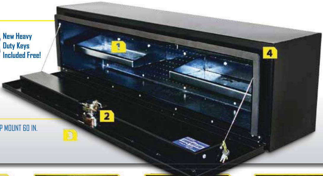
BLACK STEEL TOP MOUNT 60 IN.