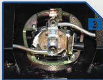
DUAL LOCKING CAM ACTION LOCKS