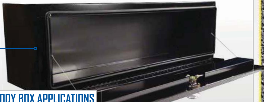
BLACK STEEL 60 IN.

Our Heavy Duty Under body boxes are the perfect solution for extra storage under your trailer or flatbed. Available in black or white steel, black aluminum, or clear coat aluminum.