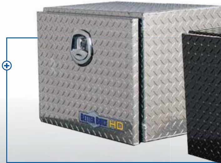
CLEAR COAT ALUMINUM UNDER BODY 24 IN.