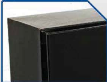
ABRASION RESISTANT POWDER COATING