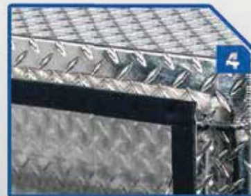
CLIMATE LOCK WEATHER SEAL