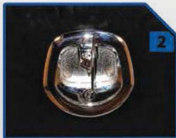
HEAVY DUTY 3-POINT LATCHES