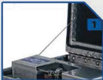
HEAVY DUTY STEEL DOOR CABLES