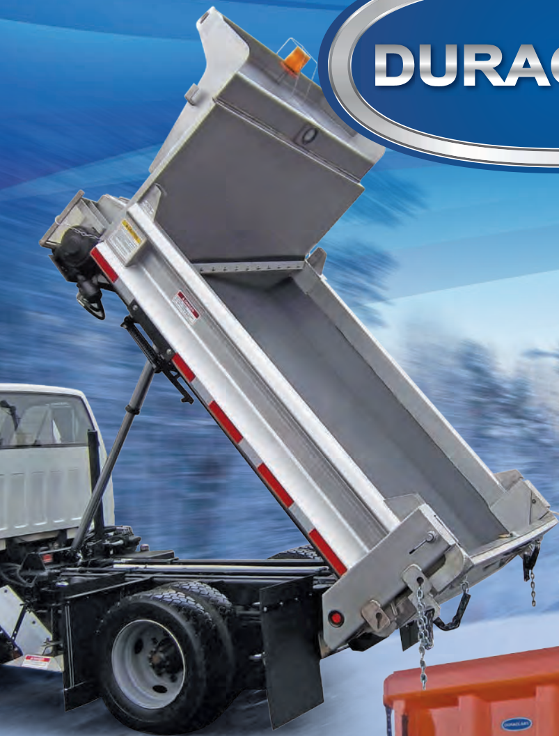
Sidewinder Jr. shown with optional equipment.