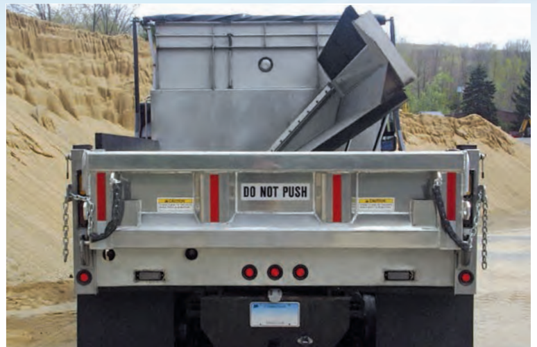
The DuraClass Sidewinder features premium high quality construction including rugged, COR-TEN® steel and continuous 100% welding on the body.

All bodies shown with some optional equipment. Models and options are subject to change without notice. Vehicles pictured may include optional installed items which may not be standard equipment.