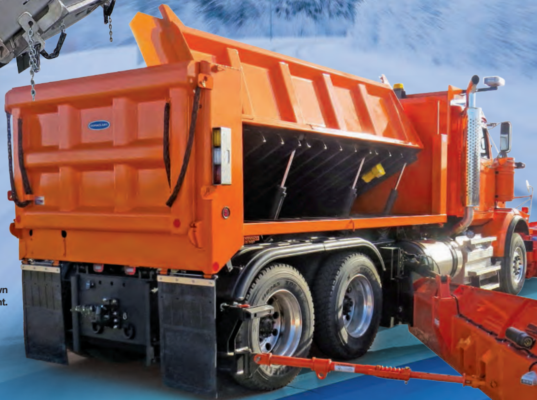
Sidewinder shown with optional equipment.