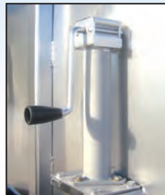
Manual chute control