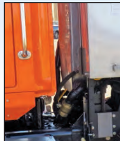
1) Gear box for chains