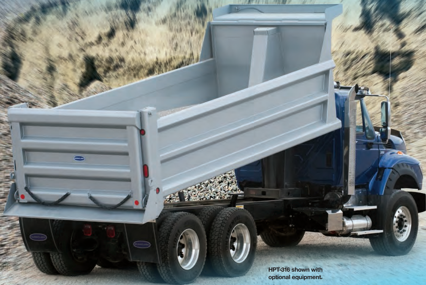
HPT-316 shown with optional equipment.