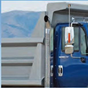
DuraClass HPT-316 features fully enclosed front corner posts.