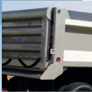
DuraClass bodies come with full depth corner posts and enclosed tailgate hardware.