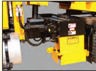
Front Cross Conveyor with Two Ply High-Temp Rubber Belting and Front Mounted Spinner