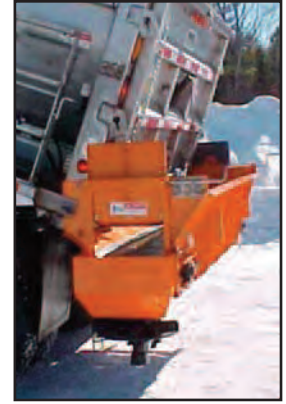
Rear Cross Conveyor