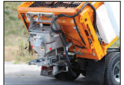
Salt Slurry Generator