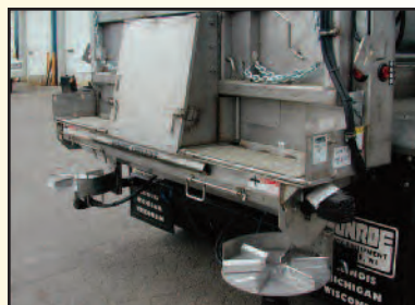
Tailgate Spreader with Dual Discharge