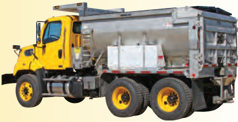
Corrosion Resistant Stainless Steel