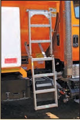
Fold Up Ladder