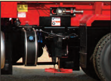
Side Spinner w/ Drop Chute