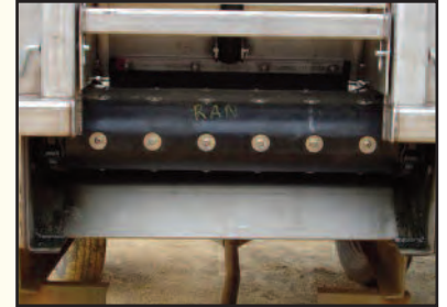
Belt Over Chain