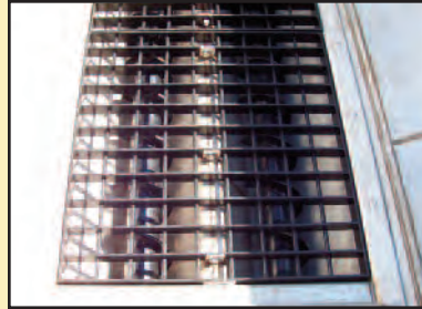
Dual Auger with Bottom Screens