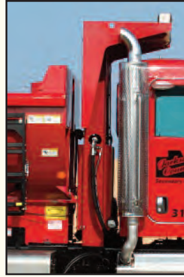
Stand Alone Cabshield