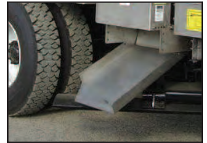
Optional Folding Berm Chute for Front Cross Conveyor