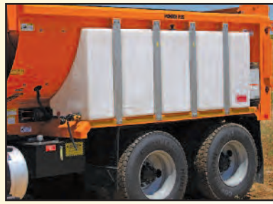
Fender Mounted Pre-wet Tanks