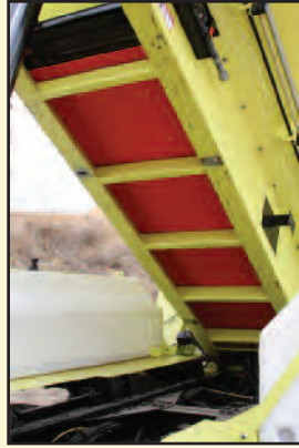
3/8" Poly Sub Floor Kit