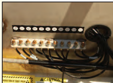
Remote Mounted Grease Extension with Each Grease Point Clearly Labeled. Available for Front and Rear