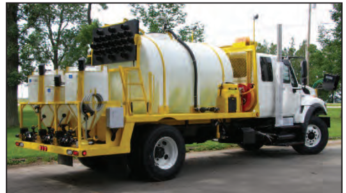
1300 Gallon, 4 Product Injection System with Sign Board Option

For questions or to place an order, please contact HAWKEYE TRUCK EQUIPMENT at 515-289-1755 or 1-800-622-8223.