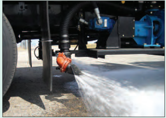
Street Flusher System