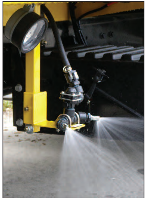
Guard Rail Underbody Spray Booms Manual or Power Height Adjustable. Optional Spot Light Shown