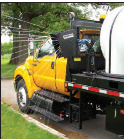
Spray Head: Front, Mid or Rear Mounted. Multi-Zone Spray Load with 30° Linear Actuation Tilt to Follow Ground Contour.