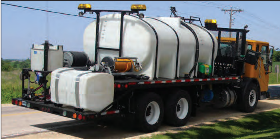
2700 Gallon Flusher System w/ Removable Rear Skid