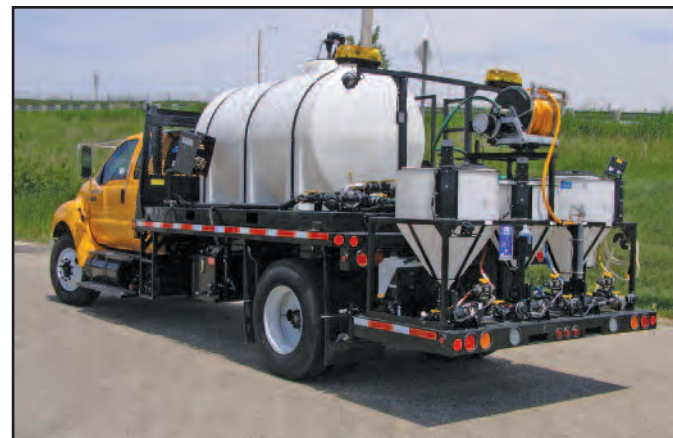
1000 Gallon System w/ Removable Skid