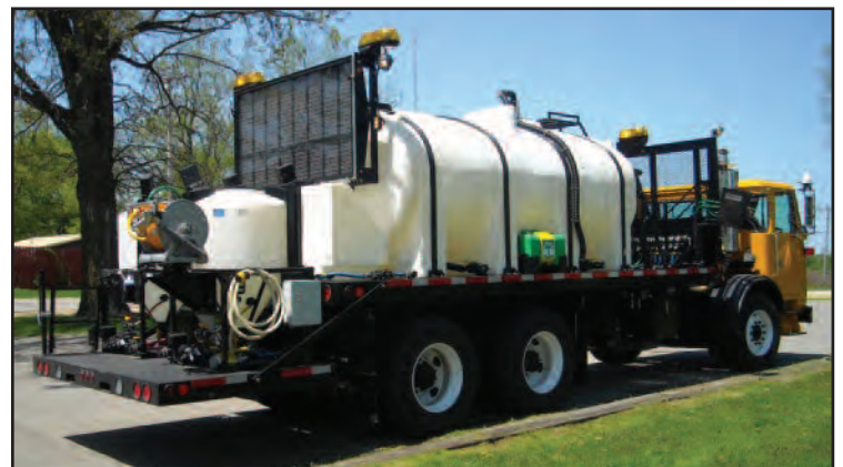
2700 Gallon Unit

For questions or to place an order, please contact HAWKEYE TRUCK EQUIPMENT at 515-289-1755 or 1-800-622-8223.