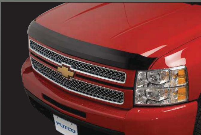
Tinted Hood Shield for Chevy Silverado