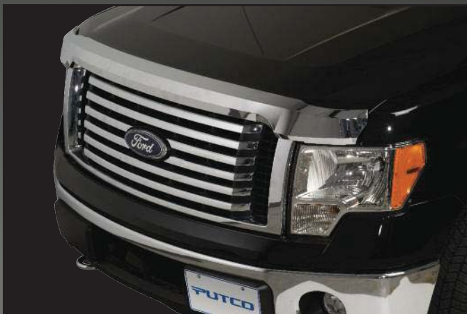
Chrome Hood Shield for Ford F-150