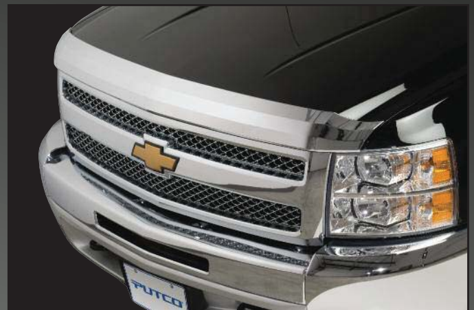
Chrome Hood Shield for Chevy Silverado