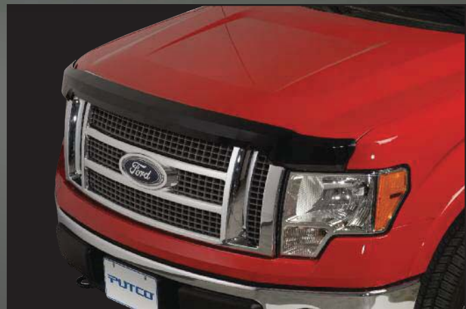
Tinted Hood Shield for Ford F-150