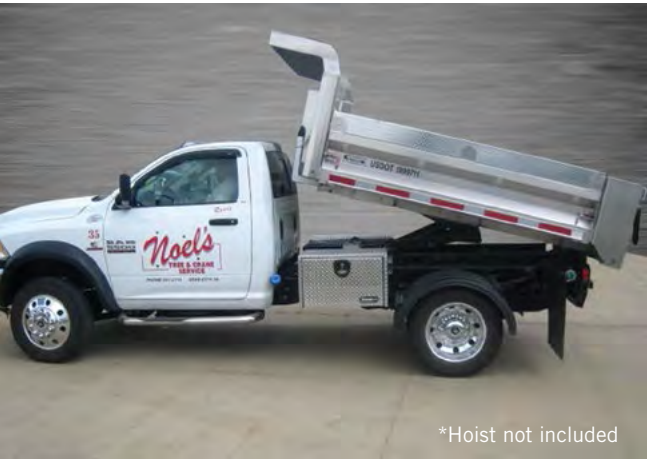
*Hoist not included