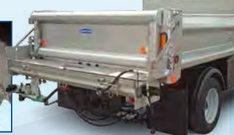
Stainless Steel Model