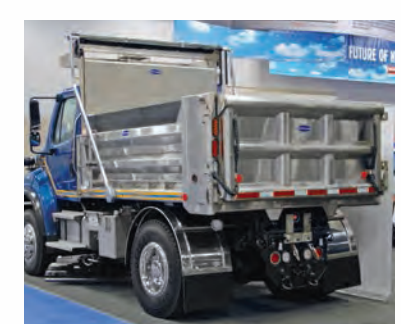
Premium Steel Construction-Minimum 45,000 psi. Additional steel and stainless steel options available.