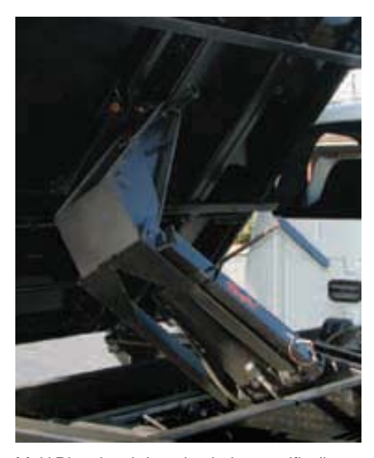
Multi-Directional dumping hoist specifically designed for MD Eliminator body.

Dumping direction is easily controlled with one lever and Rugby's standard tailgate release controls both the rear and the side release. The Eliminator-MD includes Rugby's patented EZ-LATCH™. Standard vertical side and tailgate braces along with the Eliminator's sleek design offer the complete package to make your work truck stand out! Increase productivity by combining side and rear dump capabilities