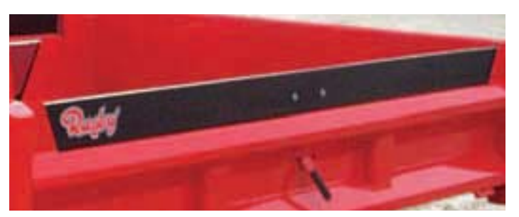
Solid Poly Sideboards for Board Pockets