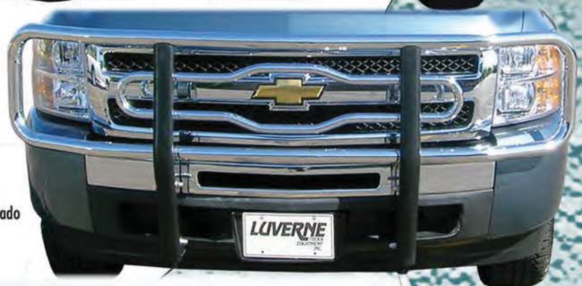
2007-2013 Chevrolet Silverado 2" Tubular Grille Guard