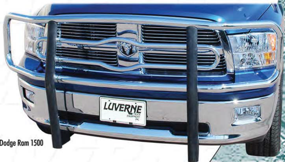
2009-2013 Dodge Ram 1500

NOTE: Does Not Work with Tradesman, Express or Sport Models