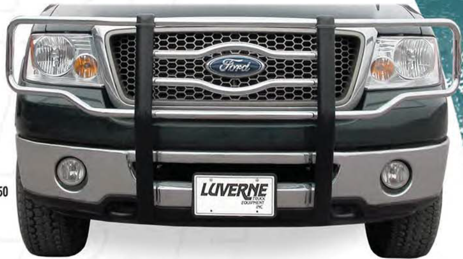
2006-2008 Ford F-150