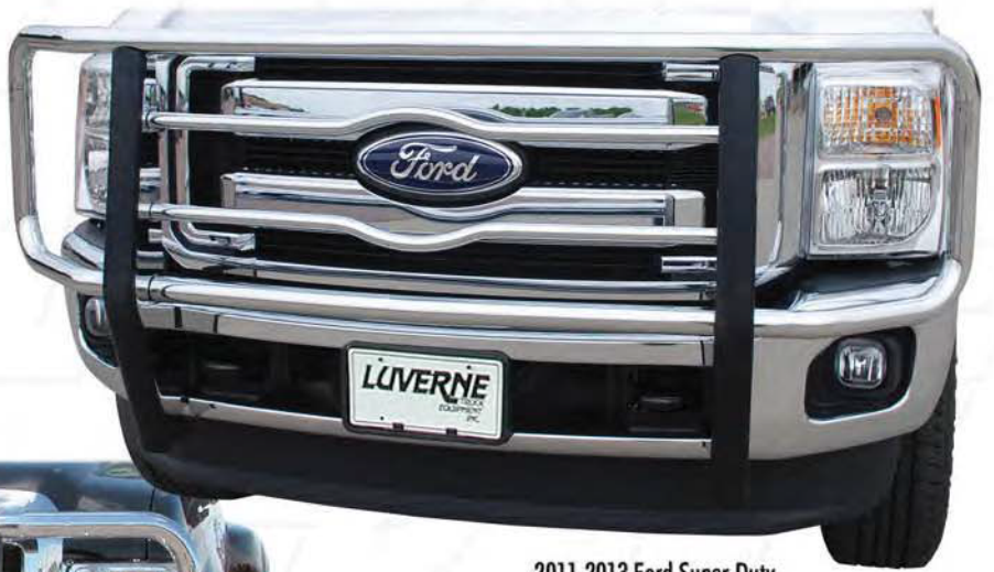
2011-2013 Ford Super Duty 2" Chrome Tubular Grille Guard