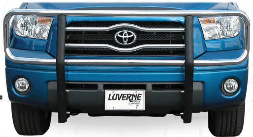
2007-2009 Toyota Tundra

NOTE: Will Fit the 2010-2013 Toyota Tundra with Minor Trimming of Plastic