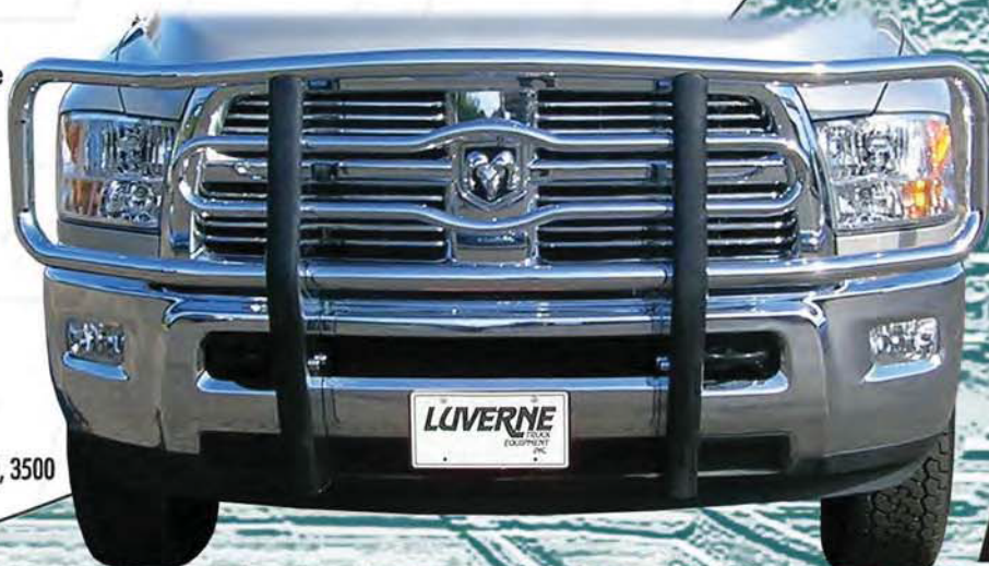
2010-2013 Dodge Ram 2500, 3500