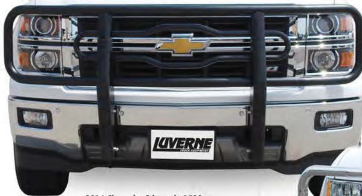
2014 Chevrolet Silverado 1500 2" Tubular Grille Guard