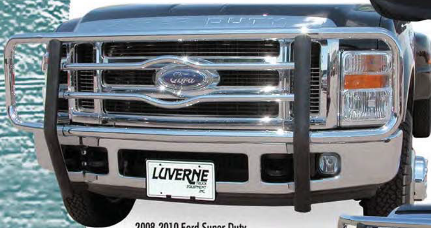
2008-2010 Ford Super Duty 2" Chrome Tubular Grille Guard