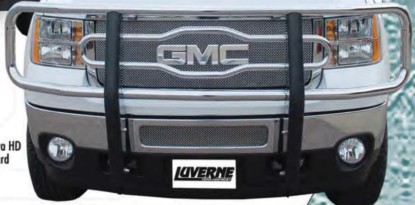
2007-2013 GMC Sierra HD 2" Tubular Grille Guard