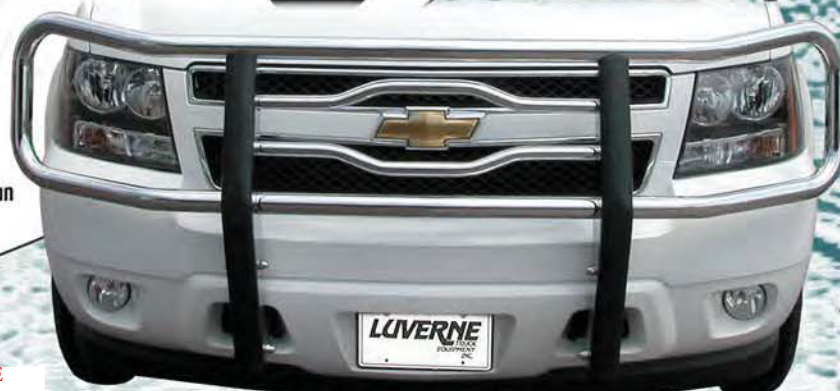
2007-2013 Chevrolet Suburban 2" Tubular Grille Guard