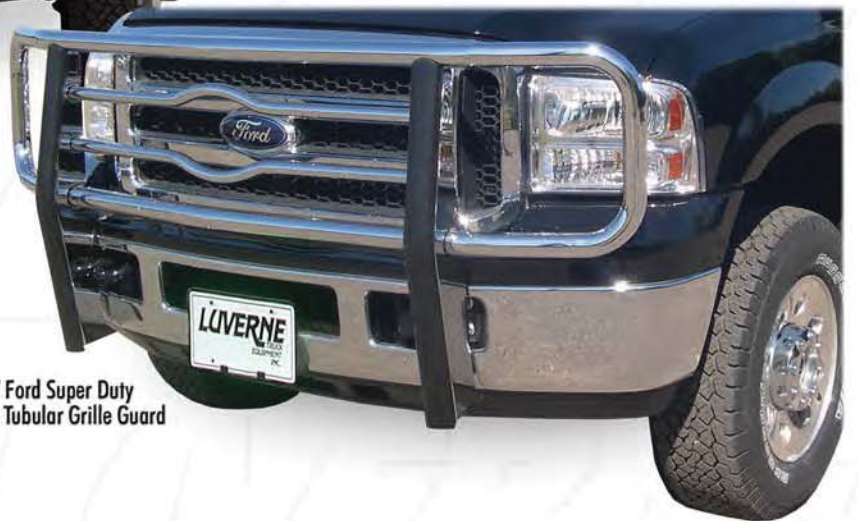
2005-2007 Ford Super Duty 2" Chrome Tubular Grille Guard