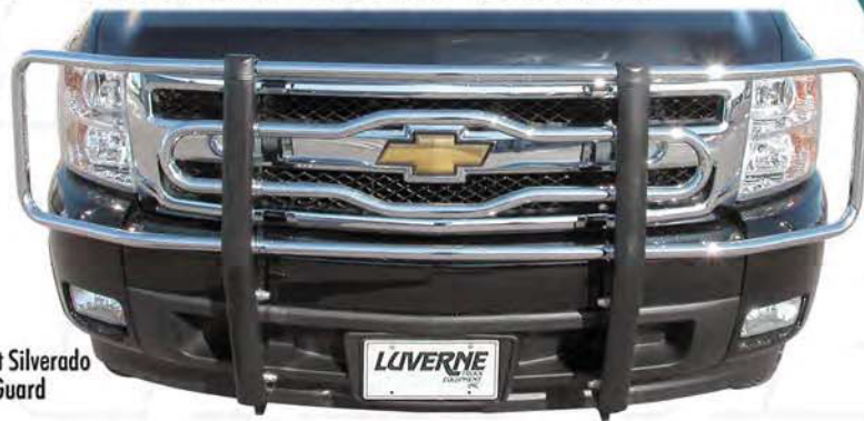
2007-2013 Chevrolet Silverado 1 1/4" Tubular Grille Guard