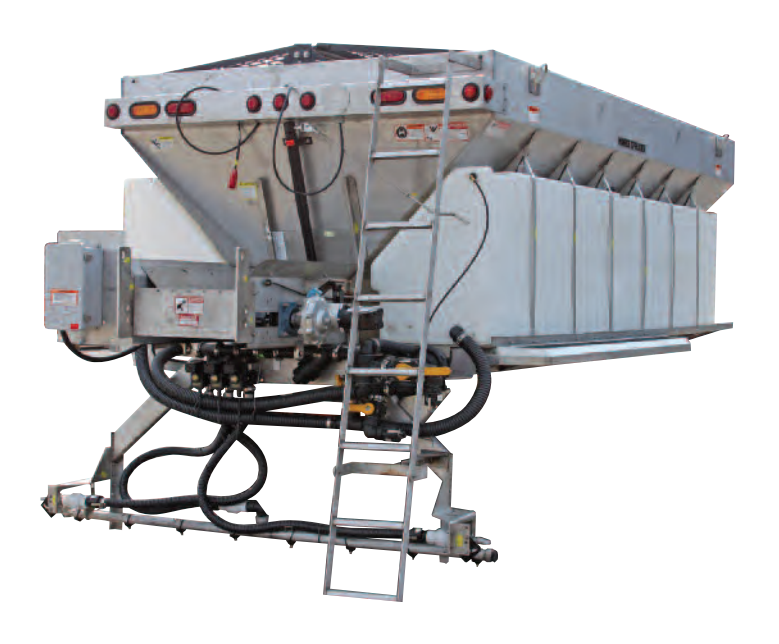
Flush & Dust Capable

For questions or to place an order, please contact HAWKEYE TRUCK EQUIPMENT at 515-289-1755 or 1-800-622-8223.