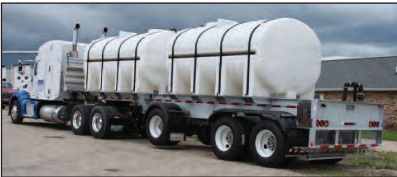
Semi Trailer Anti-Ice