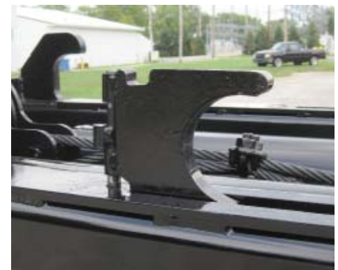
Auxiliary Fold Down Stops