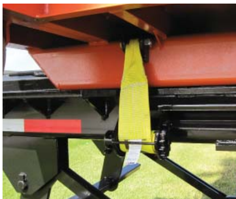
Sliding Ratchet Tie Down Straps