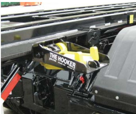
Optional "The Hooker" Securement System