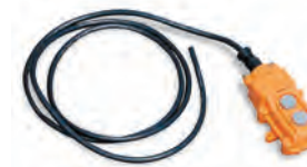
Remote push-button control with Seven foot cord