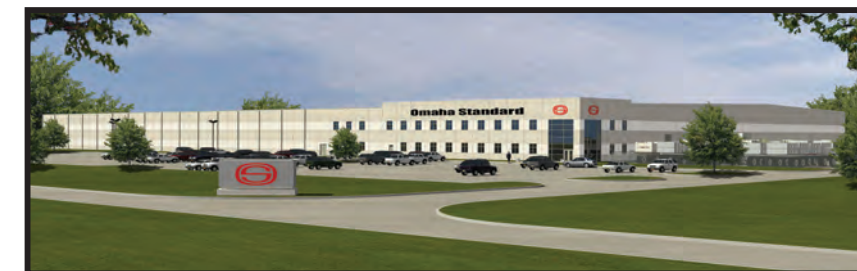
Manufactured in our new 210,000 square foot state-of-the-art facility.

Fold-out extension may be ordered as a factory option or as a kit to be installed at a later date.