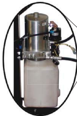
Self Contained Hydraulic Power Pack

Super Heavy Duty mesh tarps that are great for Rolloffs, hook lifts and lugger box applications. The tarp is made of 13 oz. Heavy Weight woven mesh with UV protection and 7 x 7 weave breathes to reduce flapping. Double lock stitching, with hem tube for double wrap teardrop or reinforced arm pocket and grommets every 3' for extra strength and durability.