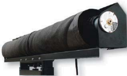
Easy Ratchet Spring Tension Adjustment

The Tower System is also available with the ultra reliable semi-automatic Pulltarp System. With the Tower fully raised, the tarp is pulled out to cover the load and secured to the back of the bin. The Tower is then lowered pulling the tarp down over the front of the bin. The heavy duty 12 gauge steel Wind Guard Housing comes complete with our external spring adjustment and has a lifetime guarantee* on the roller spring.