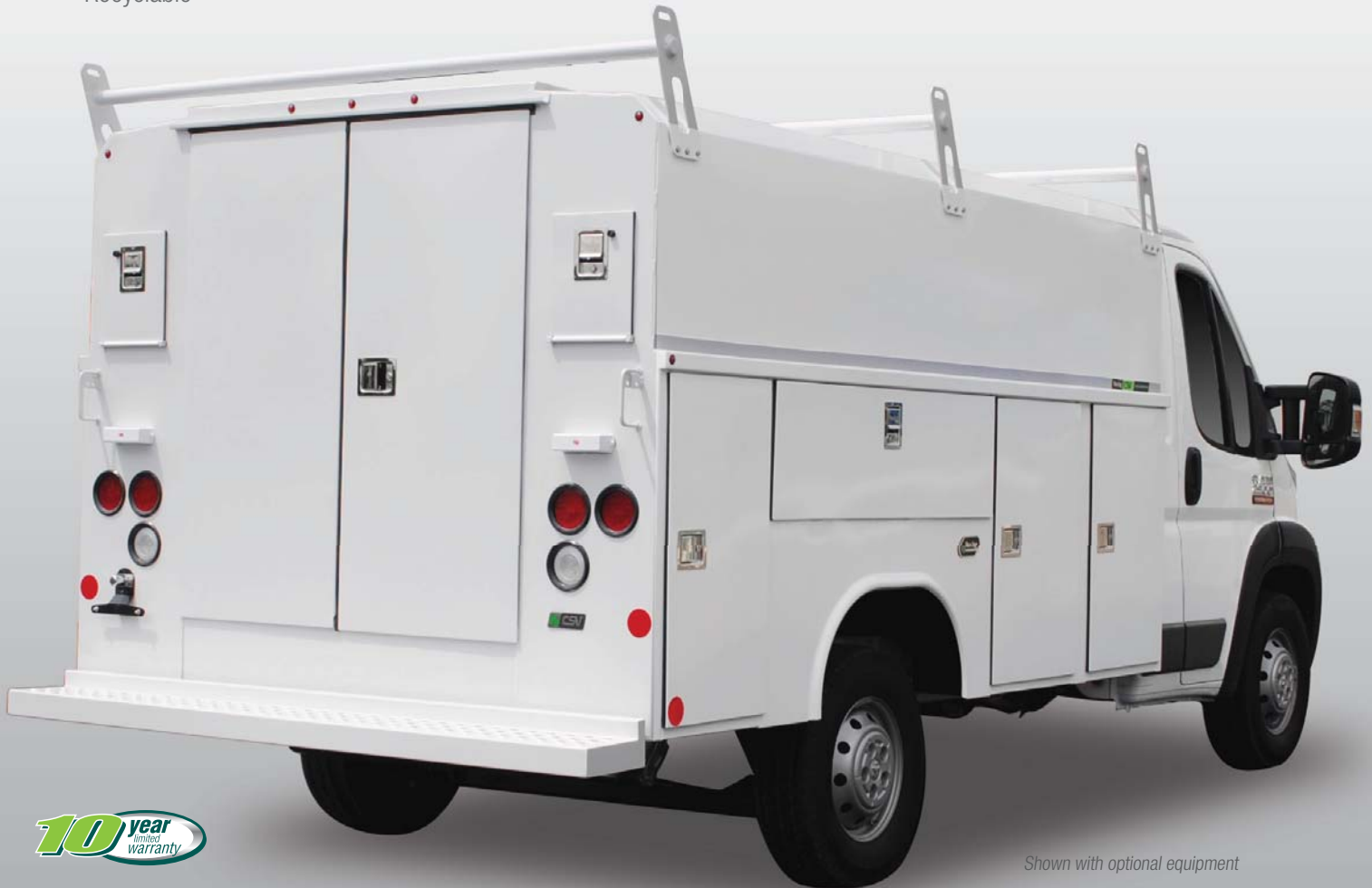
Shown with optional equipment

For questions or to place an order, contact HAWKEYE TRUCK EQUIPMENT at 515-289-1755 or 1-800-622-8223.